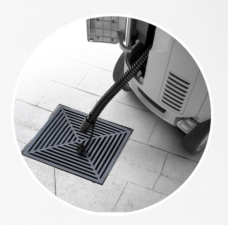
Recovery tank easy to drain.