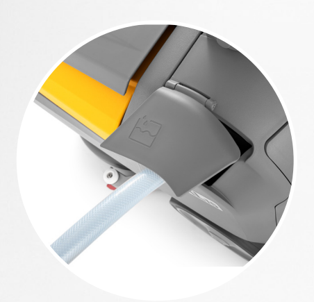
Fast filling of the solution tank thanks to the filling hose on standard equipment.